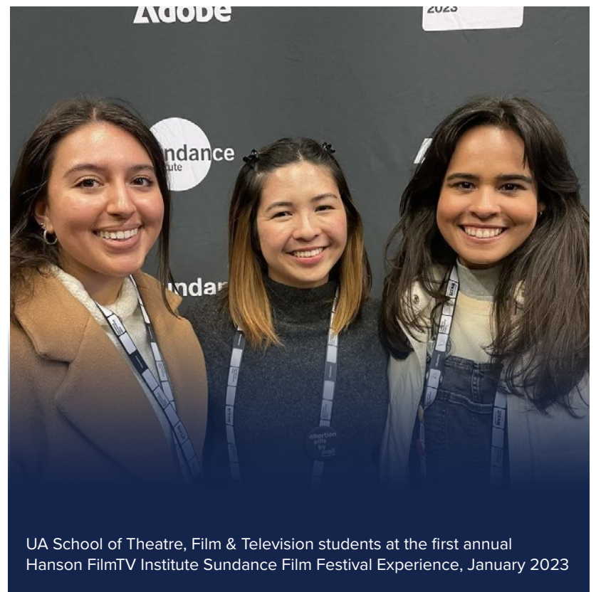
UA School of Theatre, Film & Television students at the first annual Hanson FilmTV Institute Sundance Film Festival Experience, January 2023